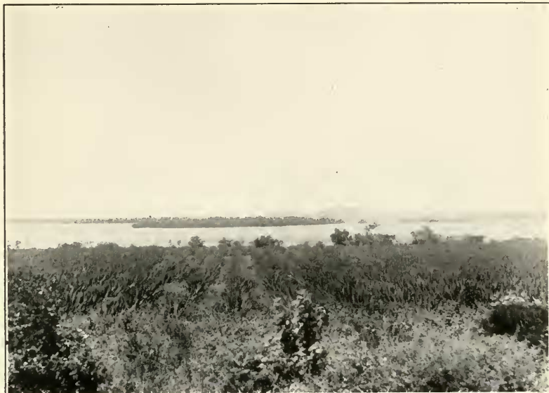
VIEW ACROSS SISAL FIELDS TOWARD MORNE DES MAMMELLES. Near Terrier Rouge, Haiti, March 30, 1931.